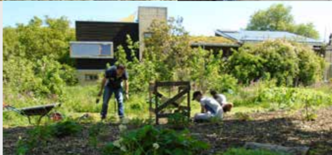
The Cellini Orchard, part of LWOS, is managed by Roots for Lambeth Borough, to provide an unusual open space for the local community, learning opportunities for our students and habitats for urban invertebrates (part of our local 'Site of Importance for Nature Conservation')